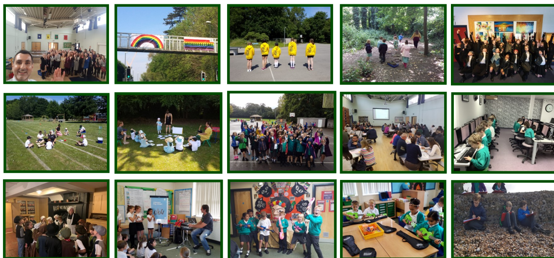
A few memories from 2019/20

Numbers 7 to 9 must be followed in every case where they are relevant.